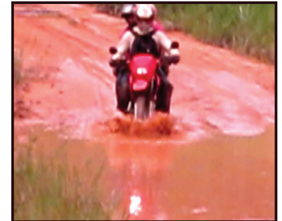
Navigating the Rough Terrain