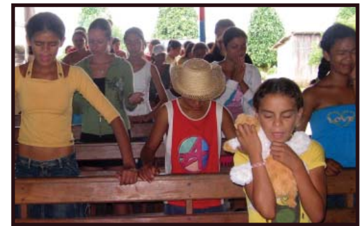
Worshipping the Lord