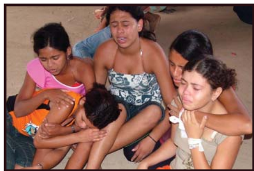
The power of God touching the youth with many special moments

whose parents were not present. The Holy Spirit started to move and someone came up and shared a word from the Lord. Joel 2:28 "And afterward, I will pour out my Spirit on all people. Your sons, and daughters will prophesy, your old men will dream dreams, your young men will see visions". After the reading, the Holy Spirit came in power and practically all the youth were in tears in the presence of the Lord. Little children were speaking in tongues, and people were prophesying. It was a joy to see the Lord touch His children in such a special way.