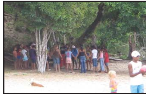
Prayer time along the beach