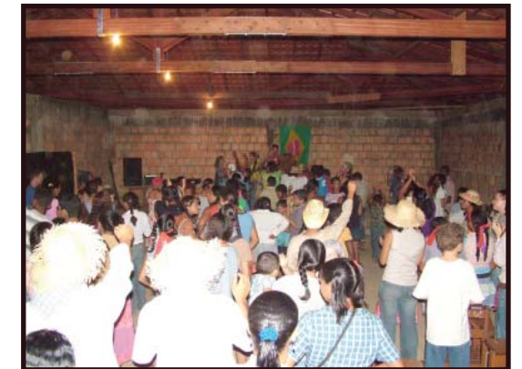
Lively worship to our Lord