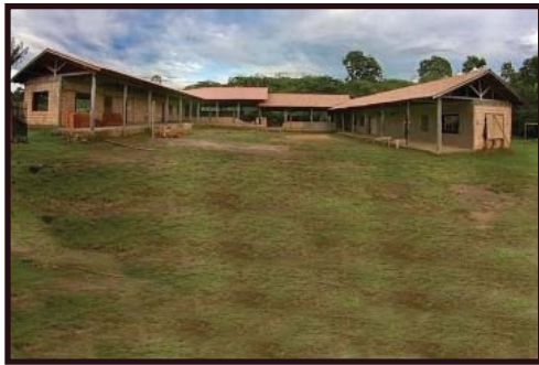
The Altamira Training Leadership Camp needs kitchen and bathrooms - $8,000.00