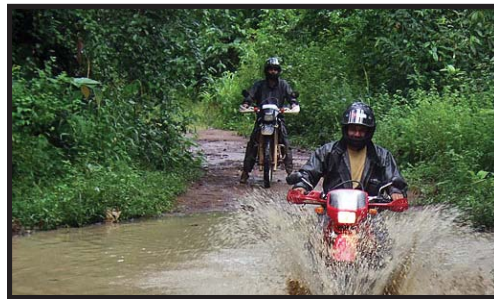
A motorcycle for more church planting - $5,500.00