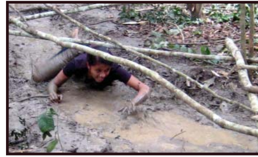
During the afternoon the youth participated in activities such as volleyball, and had races through a creative mud obstacle course through the jungle