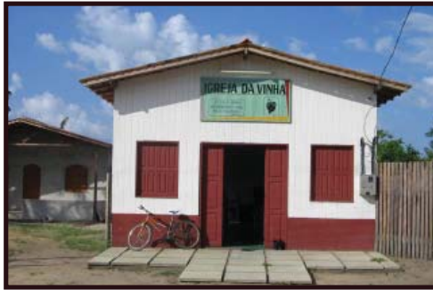
Build children school room at the Prião Church - $8,000.00