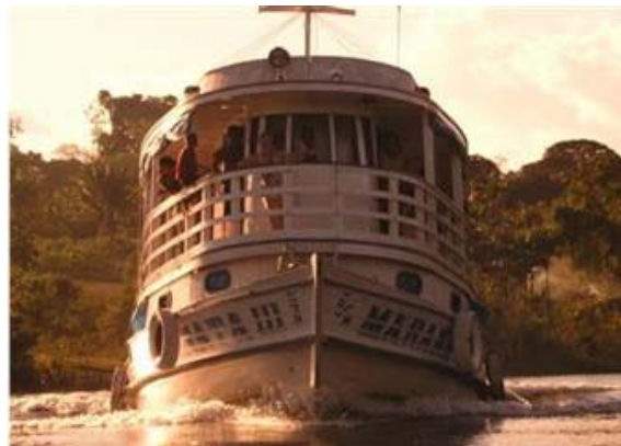
Marantha III - visiting communities and delivering water filters