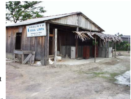
Water filter fabrication plant

especially babies who would die of dysentery. Currently there is a two man work team building the filters daily. To date, we have installed around 400 filters. This project has been instrumental in evangelizing unreached communities and creating open doors to other communities. We are excited about this project because it provides a cost affordable water solution and at the same time creates opportunity for evangelism. xm