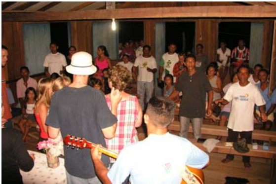
Church service along the river