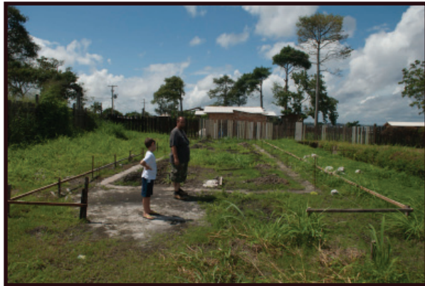
Future site of church and school

My piece of the puzzle will be starting an English school there, much like the one I have been teaching at in Altamira. Before I arrived, I didn't have a lot of thoughts concerning the English school, but once I started teaching there, I realized right way the benefits of such a place. Learning English for these communities offers immense opportunities for their future. Those who study English can get a better job or possibly study abroad at a better university.