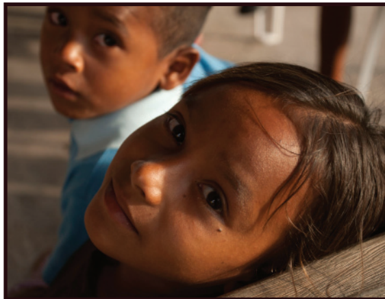
Some of the beautiful souls in Portel

This transition comes with both excitement and fear. I will be leaving behind much of the relational support I have developed here. There are many unknowns. I am certain that I will need a lot of help from others to make this work. But in all, I know that God calls us and challenges us to more, promising to go ahead of us. And when I look in front of me, I can already see Him.