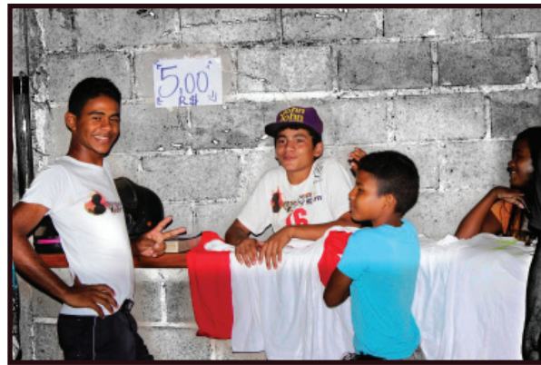
Some of the youth in the church