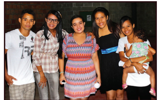
Leaders and future leaders

play instruments, and they now lead worship. Others take turns at delivering the message. These youth are even learning to organize their own fundraisers to help with their worship team, outreaches, and other Christian activities. Some of these children now bring their parents and other family members to church, and we are hearing about transformations among the adults in our community. A week or so ago, before one of the church services, I overheard a group of these young believers swapping ideas about how