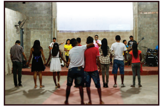
Receiving prayers and blessings