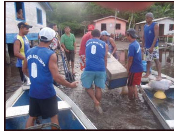
Delivering filters to families along the river community

They are individually mentored and disciple through the filters and health care, we gain the respect and the interest of these people living in the interior in the same way that the temporal works of Jesus gained the attention of the people of the middle east 2000 years ago. The Kingdom is about love and, first and foremost, we are called to love. The Biosand water filters provide a means to love the people, as they are, with "no strings". This is certainly how our Father loves us and how we desire to continue to love the beautiful people living on the rivers of the Amazon Basin.