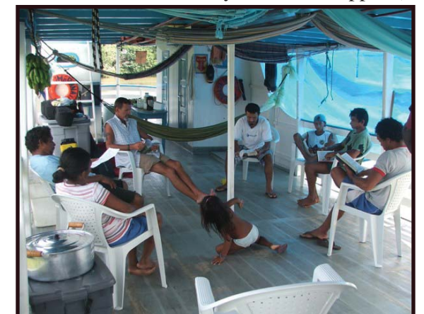
Training along the river

heard the gospel but have not yet accepted Jesus as their Savior, nor do they have any idea how to "live" as a disciple of Jesus. We take Jesus' command to "go and make disciples" very seriously and some of the ways we do river ministry has changed. We try to teach them something that is easily reproducible, and deeper. We've been spending more time with community leaders and their families, forming relationships, teaching and modeling small groups, women's groups, and mentoring, as well as providing for practical needs (such as clothes, medicine and Sunday school supplies).