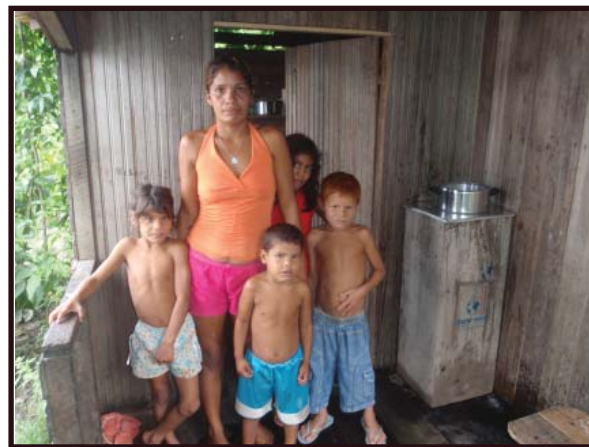
This family received a water filter

of the interior know that contaminated water is a significant source of health problems and they receive these filters with gratitude and enthusiasm. As we deliver and install the filters (each weighs about 400 lb), we have the opportunity to interact with the families in their homes, looking for ways to encourage them in their pursuit to know God and the hope that is found only in Him. We pray with each family after our work is finished, communicating to them our Father's interest in their concerns, and in them as individuals. We inquire as to their health concerns and address them medically. At times we meet with them in the evenings to worship, share a truth from the Bible, and pray for special needs. Each morning, the team meets to worship, study God's word, and pray for each other and often people living nearby on the river will join us. This delivery week is a "retreat" away from "normal" for the eight men who work with us as it is a time devoted to learning to pursue closeness with God.