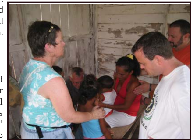
Short term mission team praying for a family

The fellowship with English speaking Christians is a welcome reprieve, the encouragement we receive helps to propel us forward in our work, and did you know that 6 out of the 8 missionaries serving in Porto de Moz were first introduced to the Xingu Mission through a short-term trip? It seems to be one way that God directs potential full-time workers. For the Short-termer, it is a chance to be used and stretched by God in new ways. The Short-termer becomes a part of something in a third world country that is bigger than him/herself. Then, when they return home, they can continue to stay personally involved, and can contribute to something or someone with whom they now have a relationship. And their relationships with others on their team will never be the same. In the coming months, there are more short-term teams on the calendar. Please pray for us and those who are traveling, that we will be empty vessels, willing to use our gifts for God however He would desire.