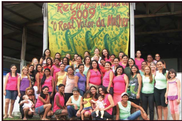
Women that partipated in retreat

Porto de Moz recently hosted our 3rd women's retreat at the camp in Monte Verde. The theme this year was "The real value of a woman." As is always the case at Monte Verde, God showed up in a powerful way, touching and liberating women from years and year of sins and abuses. It is a great privilege to serve and disciple the women in our area.