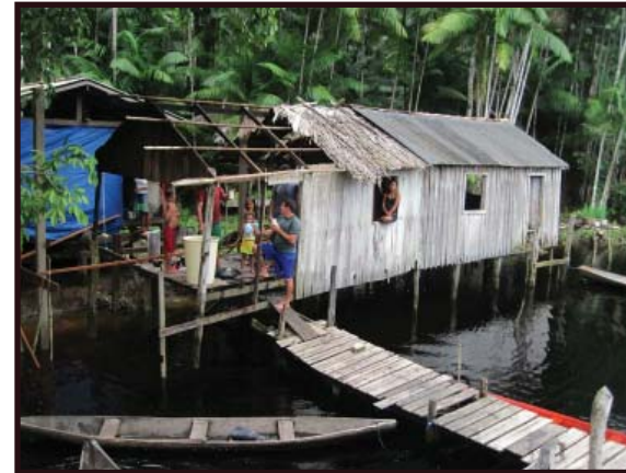
Delivering water filters to houses along the river

One thing is for sure - the mission was not built by just a handful of missionaries. Over the years God has sent numerous individuals, church teams and groups to help. The one thing that they have in common is that they have all come together as partners of the Kingdom work that God is doing here in Brazil. One work that has been carried for several years by our "partners" is our bio-sand water filter project. While the Amazon basin is abundant with water, most of it is not potable. Through our Agua Limpa (Clean Water) project, thousands of families have been given the gift of clean water. Through our contact many people have come to know Jesus as their Lord, and many people have been discipled. This past year we went through some hard moments. Just before Christmas last year our office was robbed and the thieves made off with a significant amount of money that put our project in a difficult place. At the eleventh