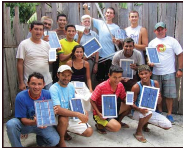
Building Solar Panels