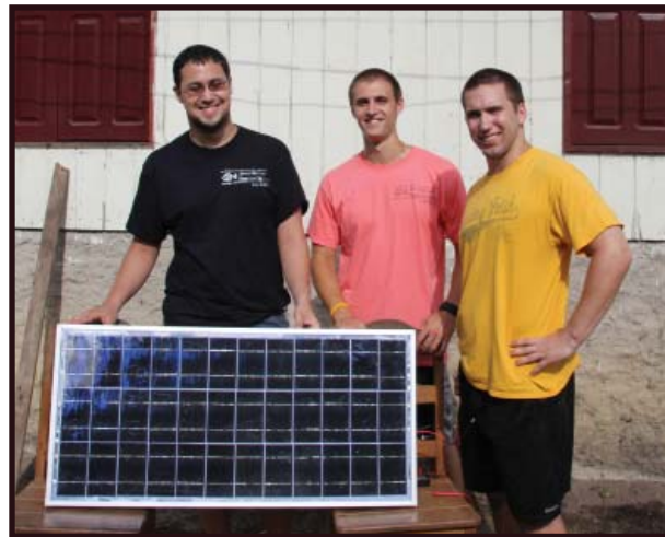
65 watt solar panel

the local church and/or mission. Over the years I have seen over and over where leaders are trained but as they live or are deployed to rural areas they end up spending a large portion of the their time in what I call survival mode. By this I mean that they are dedicating a very large amount of their time to hunting, fishing, planting in order to sustain themselves. As a result time for evangelism or leading in the community and