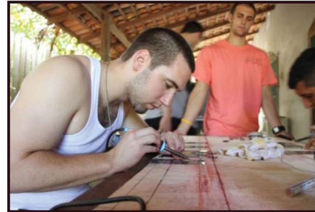
Assembling solar panels