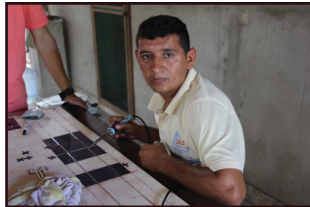
Assembling solar panels

For several years the Xingu Mission has been planting churches in remote areas of the Amazon. While we have had much success in starting churches we have encountered many obstacles along the way. One such obstacle is to not only raise up local leadership but to position that leader in a way that he can reproduce himself and churches without the ongoing assistance of