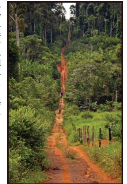
The long road