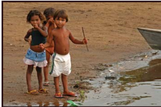
Kids on the beach

season. The road is impassable in the rainy season. We went there in the second week of Janaury and pulled up to the host home where we slept. The people of the community discussed among themselves how our truck (a 4x4) could have made it through on the road. This led to some conjuncture about the possibility of us returning and how it would be more complex depending on the quantity of rain over the following days. The road to Maribel is always paved with adventure! The Altamira team initiated the work in that region about four years ago in one community. Today, we currently minister in six communities in that region. The Lord has given us many open doors and we continual receive invitations to initiate works in