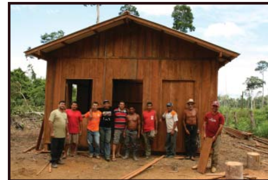
Working on building a church out in the bush