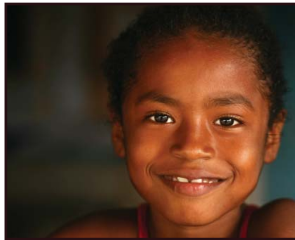
Vibrant - happy to see the missionaries

other communities, in still yet more remote places. The villagers are extremely happy when we visit. The results in one community left us with a glad heart after we ministered there. The people were animated, worshiping freely, and enjoying the time together. Then, at the end of the service, the people of the community expressed the desire to meet weekly. Some in the village have already made a decision to follow Christ and every person in the village was in attendance. They listened attentively