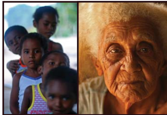
Children in the Iriri