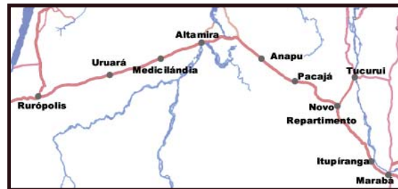
Cities along the Transamazon Highway

Due to various factors the work of planting strong and mature churches in this remote area is slow. Through the hard work of many in Altamira, we're seeing more of this vision realized. As the mother churches in Altamira mature and are actively planting other churches they are now giving increasing attention to the cities east and west on the Transamazon Hwy.