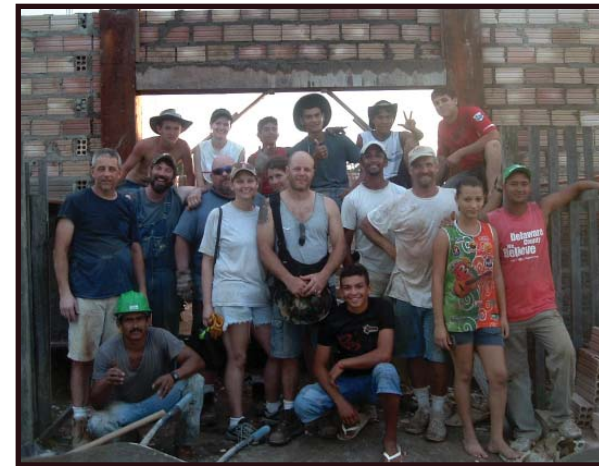
Madison County Vineyard