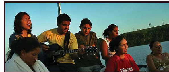
FIEL students worshipping on the boat

In the evening, we had an outreach event in the small, multisport facility in the community. There was an excellent response with people giving their lives to the Lord. FIEL has made a positive impression on the students and it was wonderful to see everyone working together. It is a great place to give students the freedom to practice things in a learning environment. Plus, it has been a huge step in helping transfer the values of reaching out to remote communities to the next generation. XM