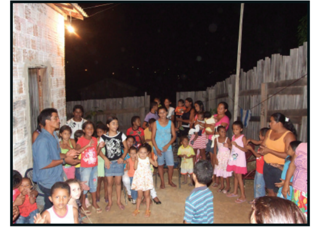
Home group in Anapu

leader. Through a monthly meeting of believers from three local communities, the believers around Anapu are becoming united in the vision of starting a church in Anapu. They are starting to see themselves as the church leaders, rather