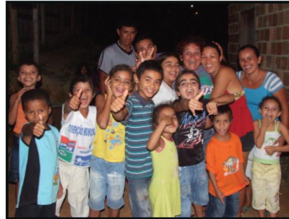
Home group in Anapu