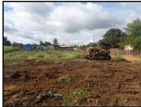
Preparing to start to build church in Uruará

July they will move to the Iriri river which is another 3 hours by car on a rough road. The road ends at the bank of the river in a small community of 5 houses called Maribel. They moved there in September of 2010 and began ministry to the river folks where there are no churches. There are many villages up and down the Iriri river waiting for the gospel to come. Audio bibles have been a huge blessing to this region and many folks are catching word that if they are illiterate, the missionaries will give them a talking bible. The work is expanding day by day along the river. We need $6,000 to help move this work forward.