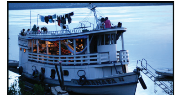
FIEL outing on the Maranatha II