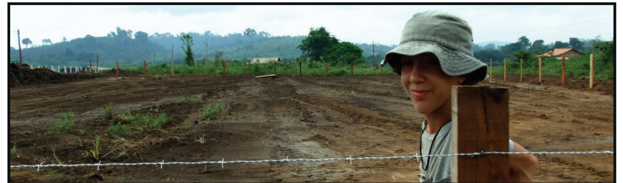
Below - Logan Wilson at the church property in Pacajá

than wait for someone to come from Altamira to be their leader. This is an exciting step of maturity and vision. The Altamira leadership is now looking to Pacajá, a city 1 ½ hours east of Anapu, to be the location of a church planting base to further reach and oversee church planting work in the region east of Altamira. Some church property has been purchased in Pacajá, and the Mirante church is releasing the Wilsons to invest in Pacajá upon their return from furlough in Fall 2011. Please, pray that the Lord will open doors and hearts in Pacajá and continue to grow the work in Anapú.