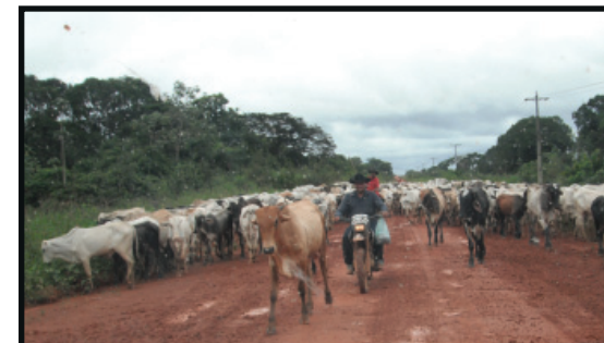
The Transamazon Highway

We have started churches in five of these towns in recent years. In partnering with the churches, we can accelerate the growth and expansion by providing capital, prayer, logistical, and training support. All of these dovetail together to meet in a place that can provide for exciting growth. As you read the following stories, open your heart to how God can help you partner with us to realize this dream.