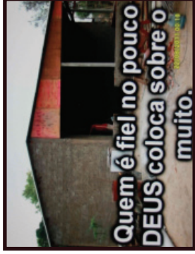
Whoever is faithful with little God will bless with more

be a blessing serving God in this new church plant. It is also a blessing to see our vision of training leaders, and churches planting churches being fulfilled. The more we can have the churches looking to each other for support and guidance, the more the church planting will continue to excel and grow, God's Kingdom advances, and God receives the glory!