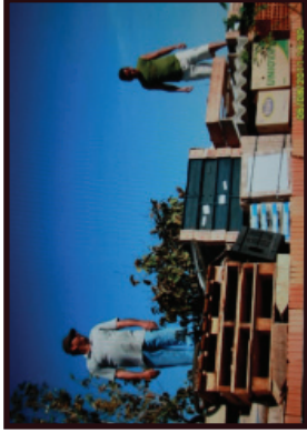
Delivering Material for house