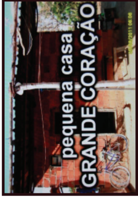
small house - BIG HEART