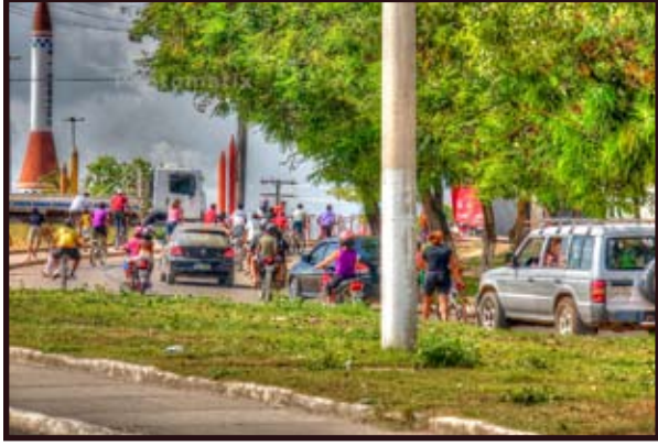
Bicycle parade through the city