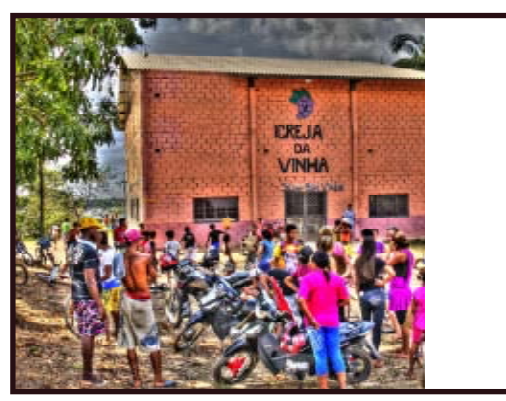
Gathering at the church