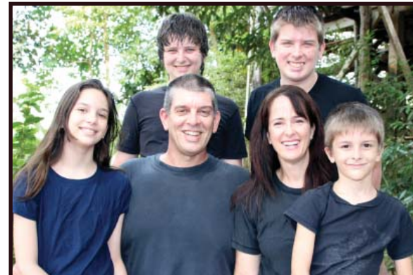
The Simon Family

However, in conversations with our mission and national church leaders, and considering the future of our movement of churches, it is apparent that God is providing an