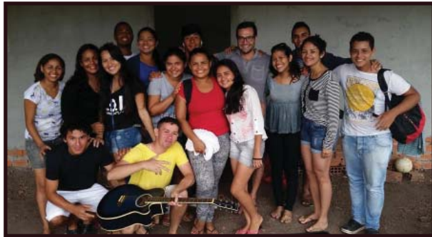
Our new friends in Macapá