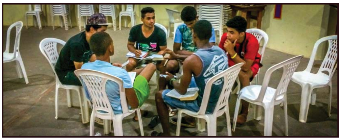
Discovery Bible Series group discussion. There is a lot of excitement about this new opportunity