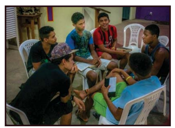
Group discussion about Discovery Bible Series

teach. The Bible and the HS are the teachers. The missionary/disciple/leader is a facilitator, leading with questions and learning to let people discover the truth.)