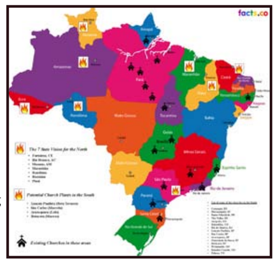
Map of Future Church Plants

As missionaries we feel called to expand the Kingdom of God through church planting. Missionaries are key in this role because of