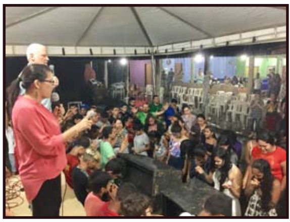
The young men praying blessings over the young women

partners, and these men are often absent from the children's lives. If the fathers are present, they usually bring with them some form of violence and addiction. It is also not uncommon for unplanned children of young mothers to be passed off to other family members. In the end, a child could have 3 or 4 different care givers before they become adults. The people of this region are, in many ways, like orphans, never knowing the security and stability that family life is supposed to offer. The love and nurture of