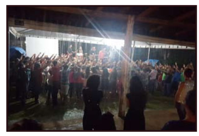
Not even the rain was going to stop these youths from recieving the blessing God had for them at Cristoval

a father and mother is, sadly, a foreign idea to them. And of course, the cycle of brokenness continues into the next generation.