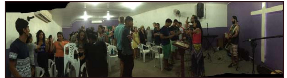
Church Service at the Macapa Church