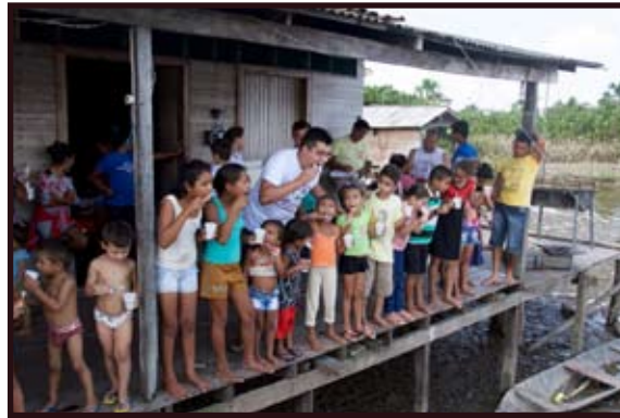
Teaching the kids in the river communities to brush their teeth

Something that has been very important for us is to always be outreach minded as we plant the church so that an Ethos of compassion becomes part of the church's DNA. Over the years we have done medical outreach, been involved with solar energy projects, water filtration and dental clinics, to name a few. The last few months we have been retrofitting the mission boat, the Maranatha III, to provide