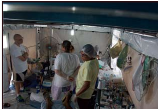
Dental Clinic on the Maranatha III

Something that has been very important for us is to always be outreach minded as we plant the church so that an Ethos of compassion becomes part of the church's DNA. Over the years we have done medical outreach, been involved with solar energy projects, water filtration and dental clinics, to name a few. The last few months we have been retrofitting the mission boat, the Maranatha III, to provide