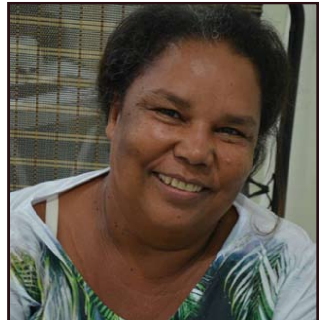
The difference a smile can make