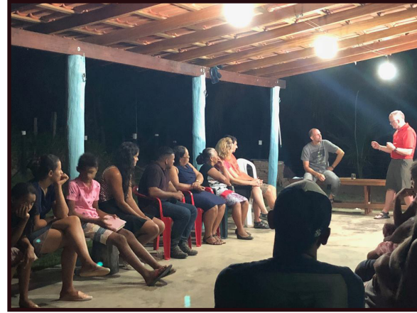
Team giving their testimony

Prayer is important. Keep up on what they need prayer for. Pray for them often.