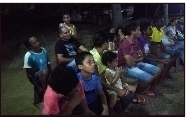
Listening intently to the Word

It is exciting to see this vision bear fruit. Together ourselves and the church are visiting and sharing the love of God with three different locations in the interior. Several from the church sacrifice their time and resources by riding out to these locations in their own vehicles to join in these gatherings where we share about God. There on the porch of someone's house or under a tree we share about the God we love and what he has done for us. It is simple. It is natural. The relationships are real and are trusted because we live life with them during these visits. Through these times together, we are seeing some hard hearts open to the possibility that Jesus is relevant and longing for a relationship. We know these hearts are opening because we see them invite others to these gatherings as well. Our relationship with Christ is not meant to be held and guarded for ourselves alone, but shared so that others may know and that requires stepping out and possibly even being a little uncomfortable.