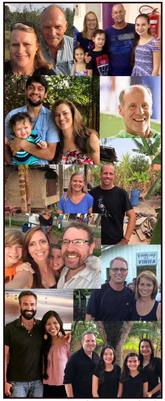
Merry CHRISTmas from our XM family

This is just a short summary of the year. If you want to know more about the work of any location or any missionary, please feel free to contact us. We would love to give more details and share more.