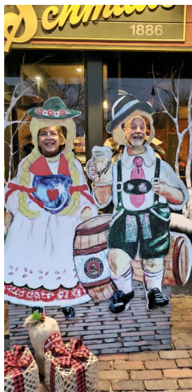
My sister and I had our picture Taken together at Schmidt's.

So, I would like to invite you all to participate in the most vital part of this ministry— PRAYER. Pray for : wisdom, confirmation, the leadership team, and the ability to cast a empowering vision to further the Kingdom of God.